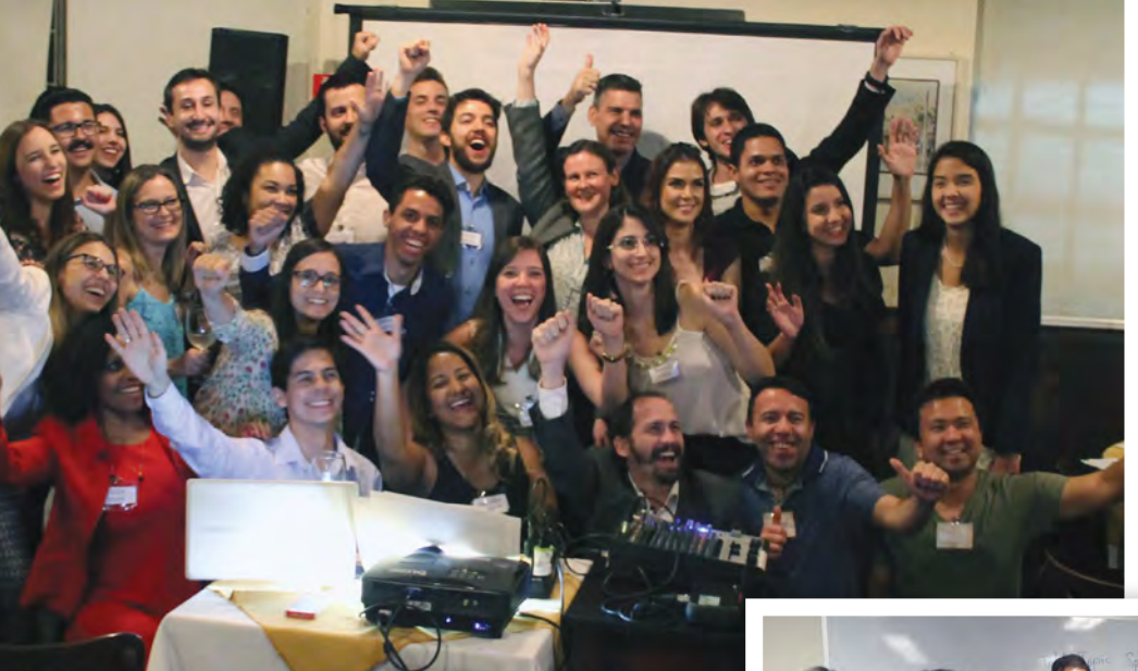
Campinas #1 Toastmasters, in Sao Paulo, Brazil, shared its charter party via Skype with the Minnesota Returned Peace Corps Volunteers club in the U.S.

ver time, many clubs become a bit stale, with members lapsing into a routine pattern each week. Sometimes it's a result of the sameness of the room, identical meeting formats or the absence of enough new members to infuse the club with new energy. Over the years I've watched clubs succumb to lethargy. Yet the remedy is as easy as a little dose of vitamin C—creativity.